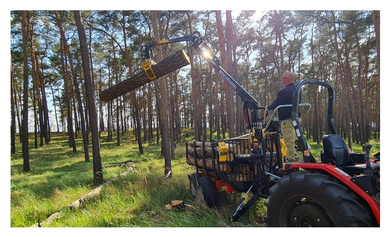
* Dimensions may vary depending on the equipment